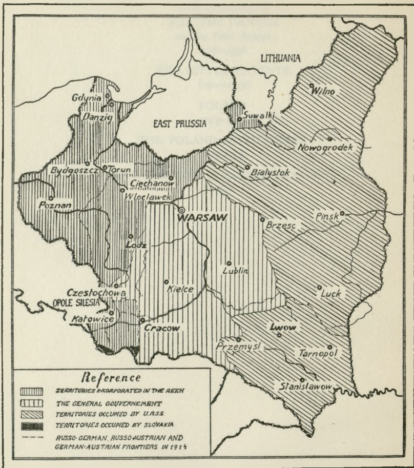
ZONES OF OCCUPATION IN POLAND : STATUS IN OCTOBER, 1939